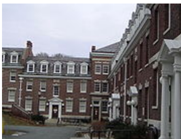
RPI's "Quad" Dormitory